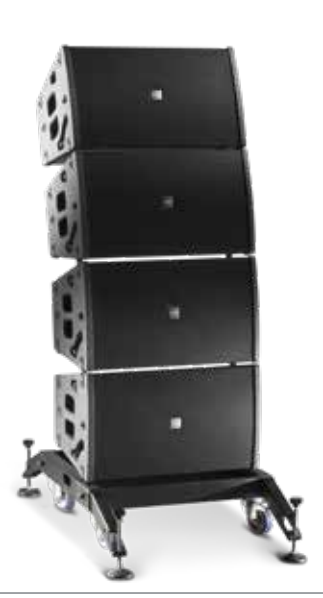
VHA406ND/N x 3 VHA112SND/SN VHA-T 406

The summit of the entire project is the 800+400W RMS amplification module with TCP/IP network interface. Based on the OCA ALLIANCE AES70 standard , it communicates with the 'INFINITO system management suite' remote control software and receives 24-bit 48-96Khz digital audio streaming from all devices compatible with the 'DANTE' standard . INFINITO is a true revolution in the FBT world that enhances the user experience, reaching new heights in terms of performance and simplicity! It is a software platform that is fully developed in house by the FBT R&D team that offers real time monitoring of the internal sensors and the status of the connected devices, fast IN/OUT Vu-meters, controls of all the parameters, group management and warnings readout. The module is contained in an aluminium chassis with intelligent forced ventilation and is equipped with an OLED display with encoder for parameter setting. A high-brightness blue front LED allows remote identification of the device also in daylight.