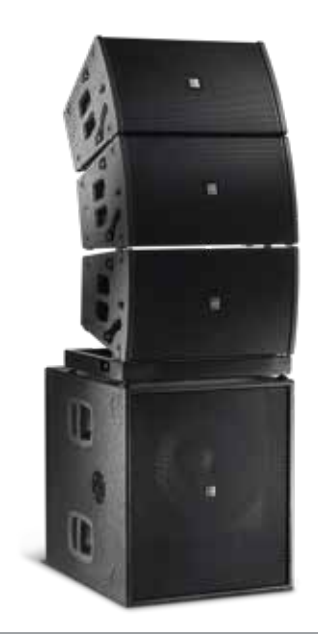
VHA406ND/N x 2 VHA112SND/SN VHA-B 406 VHA118SND/SN