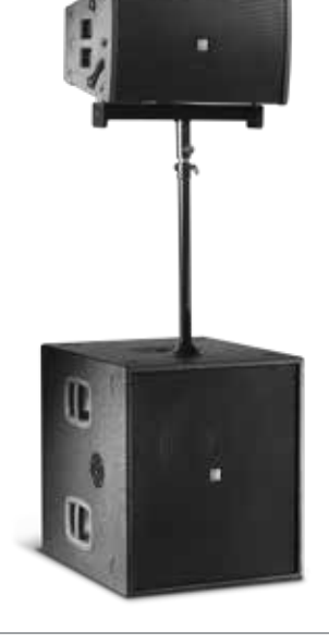
VHA406ND/N VHA-S 406 VHA118SND/SN