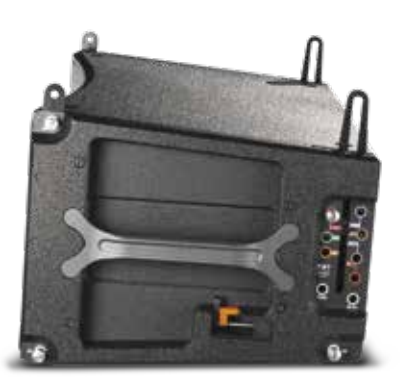
Intuitive four-point integrated rigging system