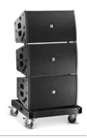
VHA406ND/N VHA112SND/SN max 3 VHA-T 406