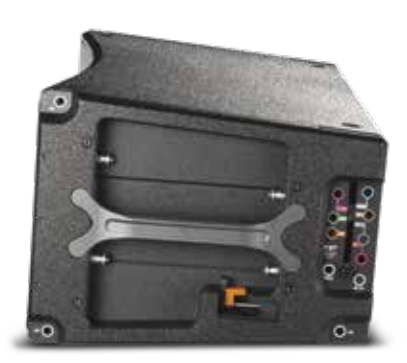
Practical aluminium handle

The MYRA 214L is Bi-Amped through a NEUTRIK NL4M connectors, one channel for LF and one for the MID/HF with internal passive crossover. The lowest octave of the Myra system is seamlessly reproduced by the companion 218S, a reflexloaded dual 18-inch subwoofer with custom designed, long excursion B&C woofers. Combining accurate cabinet resonance study and ingenious port arrangement which is designed to reduce turbulence and eliminate non-linearity, MYRA 218S delivers substantial low frequency energy down to 25Hz and can offer standard or cardioid directivity with suitable DSP preset and physical deployment. As with the 214L mid/high enclosure, the 218S cabinet benefits from premium Baltic plywood construction and to ensure long term road-worthiness and all-weather resistance, is protected by a durable polyurea coating. A two-point rigging system is flush-mounted into the cabinet, allowing the suspension up to 12 enclosures with a 4:1 safety factor. Trucking and handling are made easy by the eight comfortable, ergonomically placed rubber gripped aluminium bar handles, along with removable heavy-duty casters.