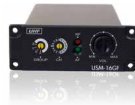
USM-16GF UHF PLL Diversity Receiver Module