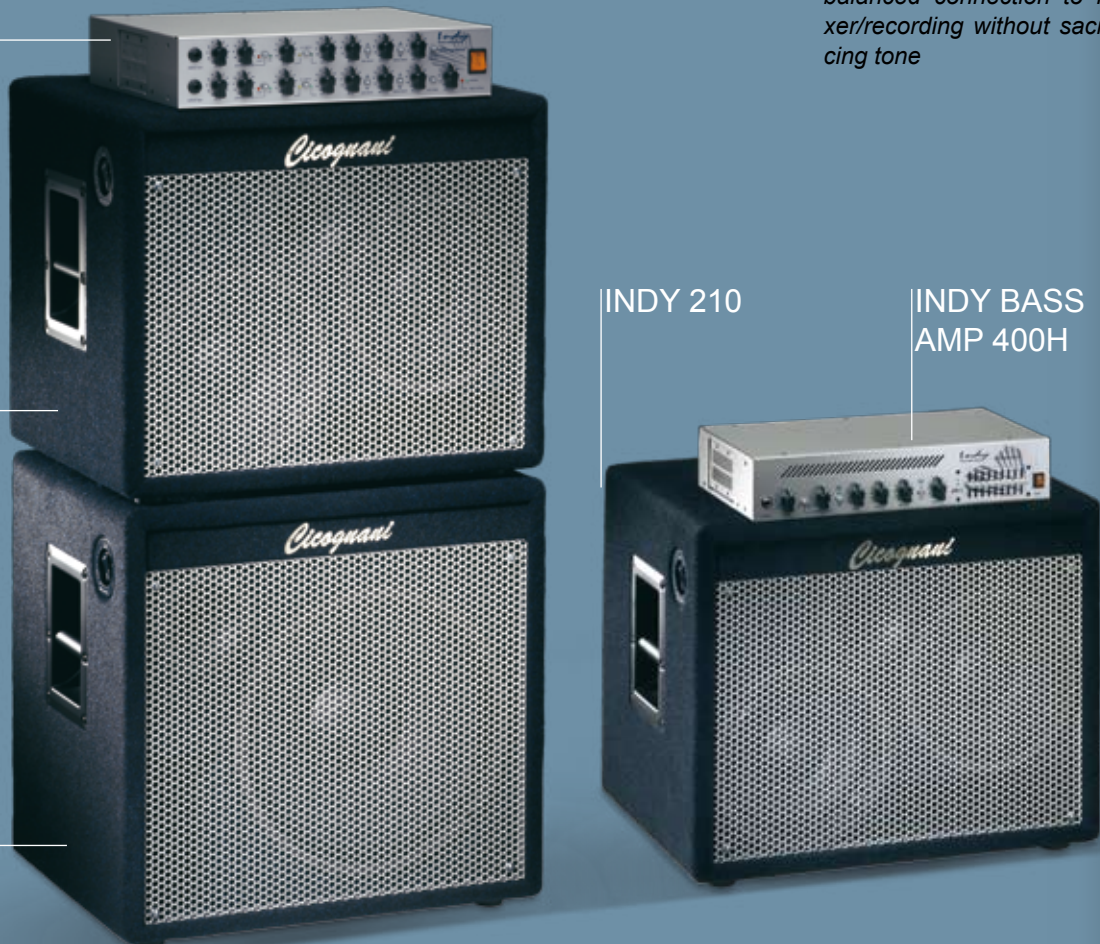
INDY BASS AMP 400H